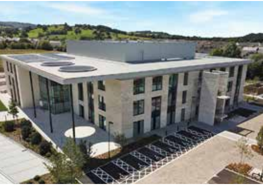
Ecclesiastical's office in Gloucester

Ecclesiastical Planning Services works with funeral directors across the country. It is part of the Benefact Group which is a family of award-winning, specialist financial services businesses that, from its profits, gives to good causes in order to transform lives and communities.